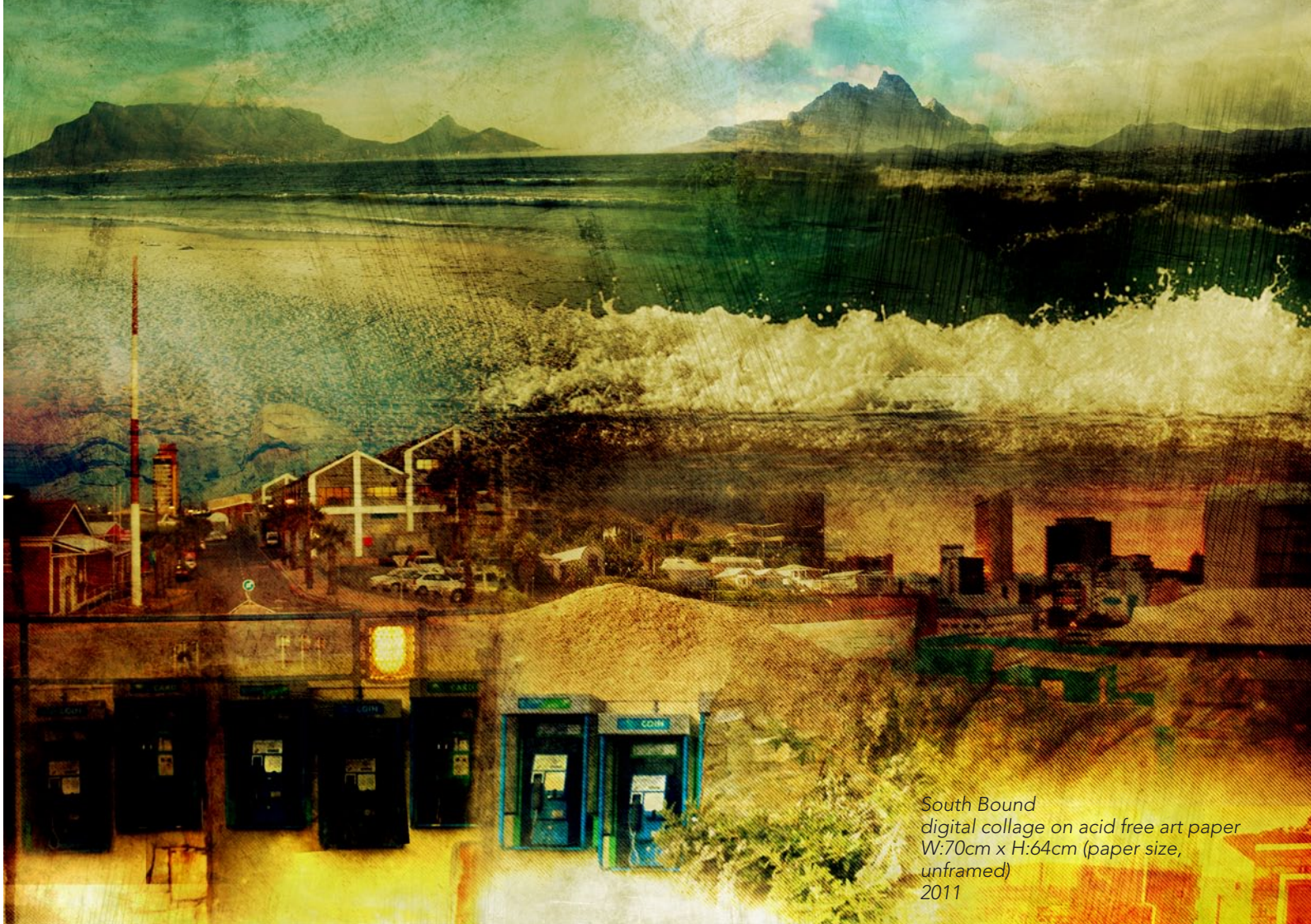
South Bound digital collage on acid free art paper W:70cm x H:64cm (paper size, unframed) 2011