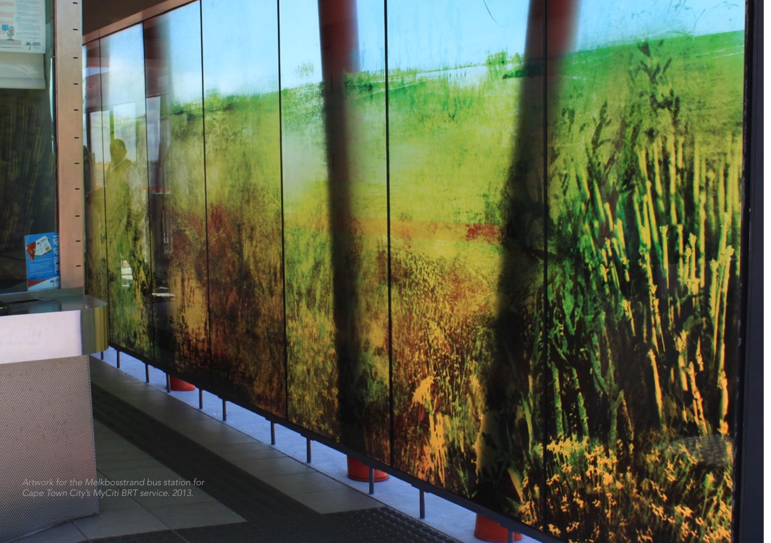
Artwork for the Melkbosstrand bus station for Cape Town City's MyCiti BRT service. 2013.