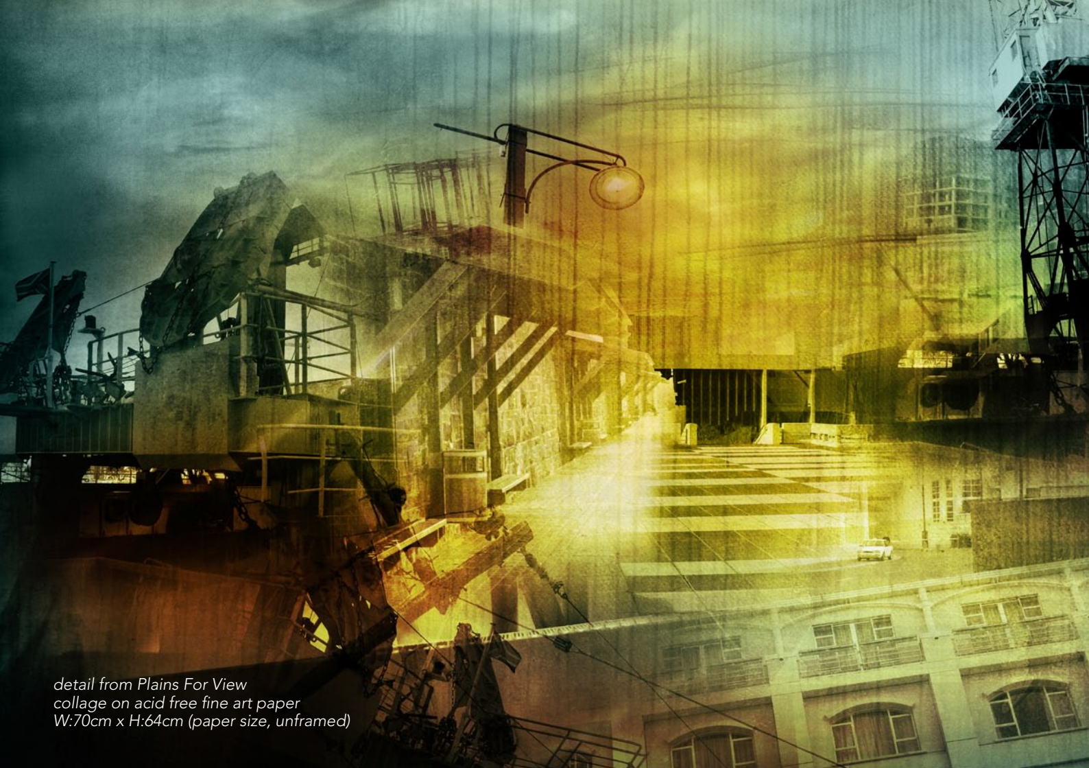
detail from Plains For View collage on acid free fine art paper W:70cm x H:64cm (paper size, unframed)