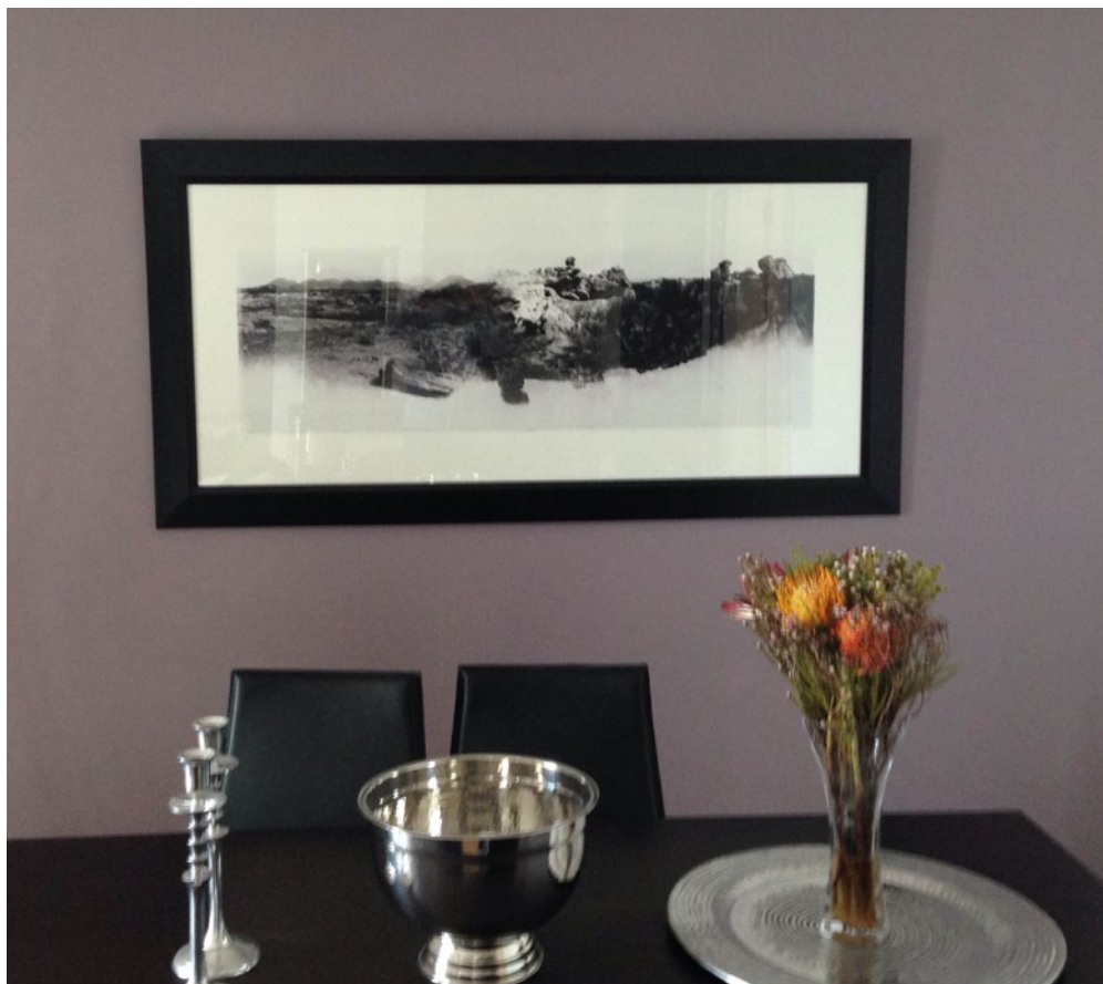
Wild Cape Point Meander Archival print on Somerset Velvet 150cm x 66cm (unframed) Edition Size: 3

A hockney landscape created to represent or express the landscape of a small section in the Cape Point nature reserve. The photographs were taken with 20-year old camera on Agfa film, on a walk along the Shipwreck and Sirkelsvlei trail in the reserve. The artwork seeks to capture the essence of the landscape, shaped out of interesting rock formations, fynbos, open grass fields that sway in the breeze, and open rocky spaces with mountains in the far-off distance towards the East.