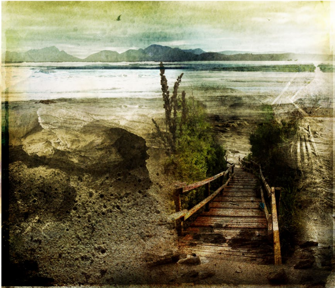
Nuances: George Sedgfield W:65cm x H:65cm (unframed). 2012.

This Nuances work was inspired by the beaches and lakes of Sedgfield on the Garden Route. The Outeniqua Mountains close to George is visible on the horizon. The eb and flow of life and ecology is so tactile and visible in these areas, that it almost seems like a you enter through a walkway into a new world, a respite from "everyday life". Sedgfield is classified as a "slow town" and boasts a weekly farmer's market. Most of the beaches fall in nature reserve areas, as part of Cape Nature, and the beautiful stretches of beach are almost unspoilt.